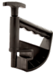
Bead Holding Clamp (EAA0247G70A)