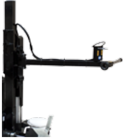
Pneumatic Bead Assist (EAK0317G91A)