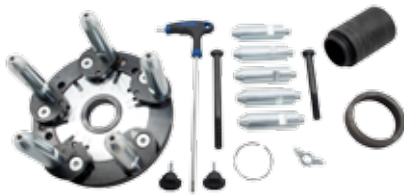
Reverse Mount Wheel Adapter Kit (EAA0364G00A)