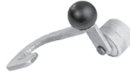
Roller Mounting Help Tool (EAA0304G48A)